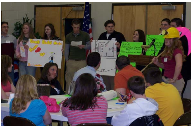
Future business leaders presenting a business plan to establish and operate a successful business.

The Logan County Chamber of Commerce held its 26th Annual High School Business Symposium at the Logan Campus on March 20, 2007. Individuals from the business sector volunteered to serve as discussion leaders to assist students in learning about the free enterprise system as it exists today. Participants in this year's event included students from Beth Haven Christian, Chapmanville, Logan, and Man High Schools.