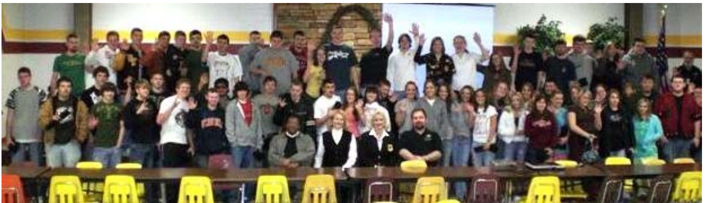
President Tomblin's High School Visiting Team recently spoke to Sherman High School seniors about the benefits of pursuing a two-year degree. The group discussed career choices, financial aid, scholarships, and future programs.

At the current time, Southern continues to have oversight of Eastern as they work through their accreditation process.