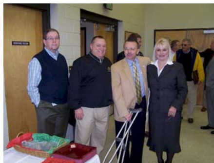
how future coal mine employees are

Representatives from 30 states and three foreign countries have visited Southern's mining academy to see for themselves