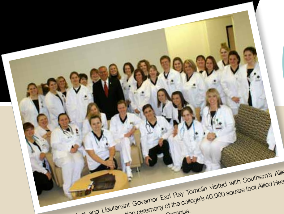
Senate President and Lieutenant Governor Earl Ray Tomblin visited with Southern's Allied Health students during a dedication ceremony of the college's 40,000 square foot Allied Health and Technology Center located on the Logan Campus.