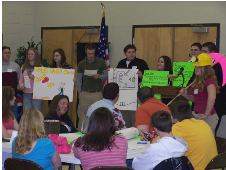
2007 High School Business Symposium — Students from Man, Logan, Beth Haven and Chapmanville High Schools presented a group business plan during the event.